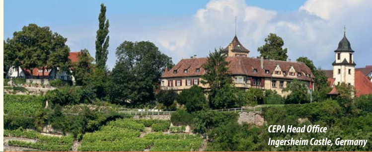
CEPA Head Office Ingersheim Castle, Germany