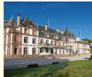
ESC in Strasbourg, France Château de Pourtales