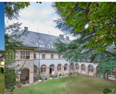
ESC in Heidelberg, Germany Villa Krehl

“During my time in Strasbourg, I learned about economies, populations, and political situations of countries that I previously didn't know where they were on a map. I learned about myself and broadened my horizons on other cultures, as well as gained connections and friends from all around the world.”