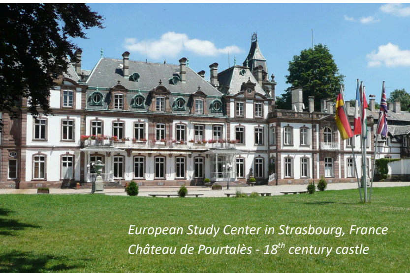
European Study Center in Strasbourg, France Château de Pourtalès - 18 th century castle